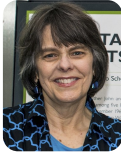
Mary Beth Tinker plaintiff in Tinker v Des Moines Independent Community School (1969)