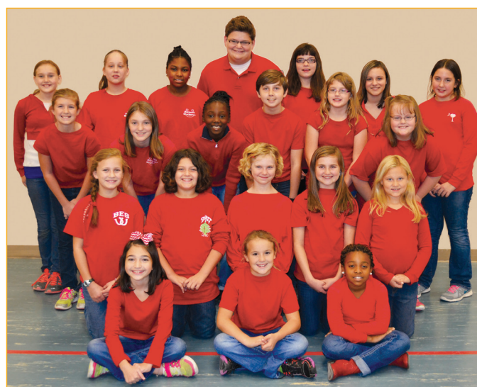
BES Shooting Stars of Barnwell 45 School District will perform during the Saturday, February 21 third general session.

Rock Hill High School Concert Choir, Rock Hill Schools