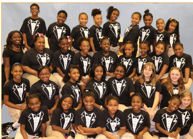
Wildcat Choraleers of Fairfield County School District will perform during the Saturday, February 21 third general session.