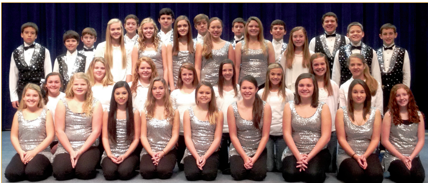
AMS Baby Blue Notes of Horry County Schools will perform during the Sunday, February 22 closing general session.