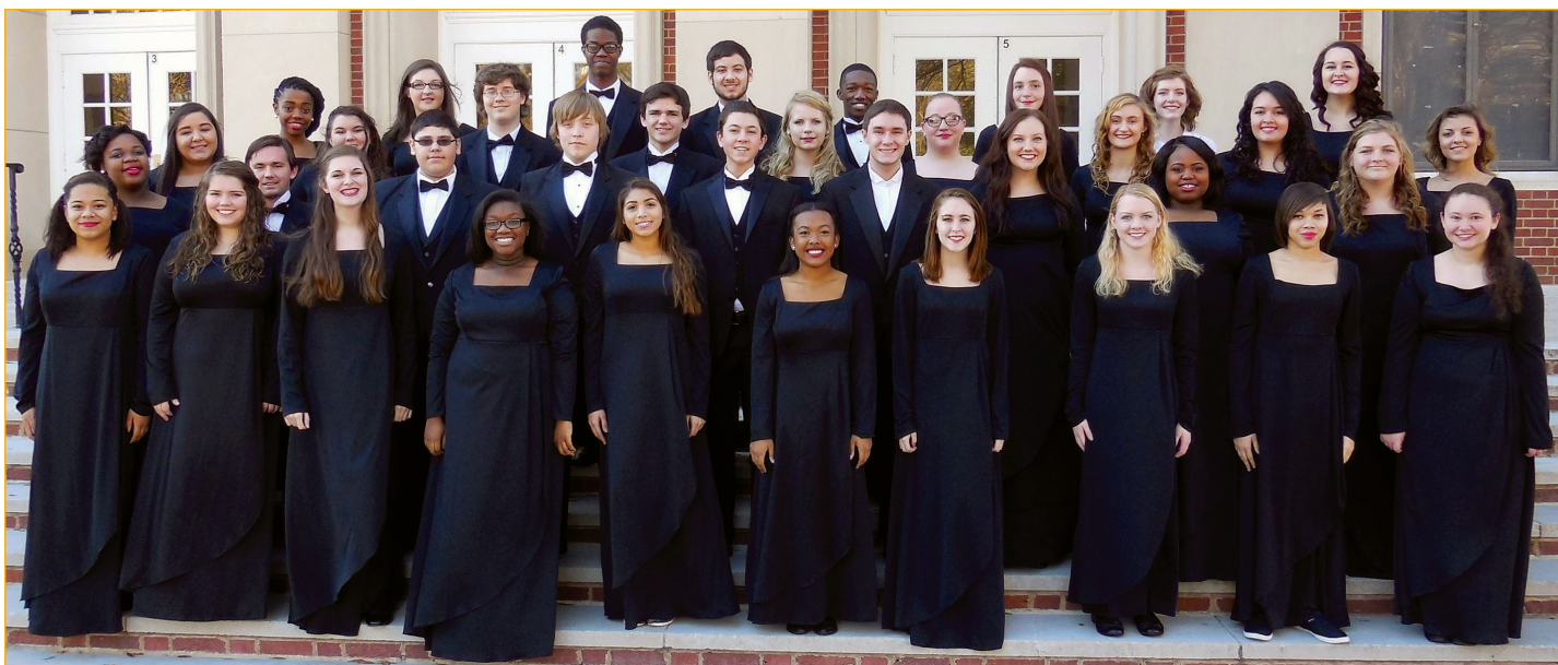
Rock Hill High School Concert Choir of Rock Hill Schools will perform during the Sunday, February 22 closing general session.