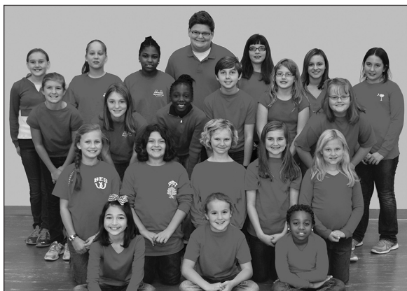
BES Shooting Stars, Barnwell 45 School District, will perform during the Saturday third general session.

Learn about the concept of "disruptive collaboration." This idea has to do with the ways in which we can improve communication, encourage the contributions of diverse stakeholders, and go beyond traditional structures of teamwork. Done right, this is a process