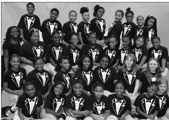
Wildcat Choraleers, Fairfield County School District , will perform during the Saturday third general session.