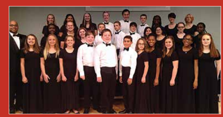
Eighth Grade Star Singers (Dorchester School District Two) will perform during the Sunday closing general session.

Breakout sessions (Choose one of six topics.)