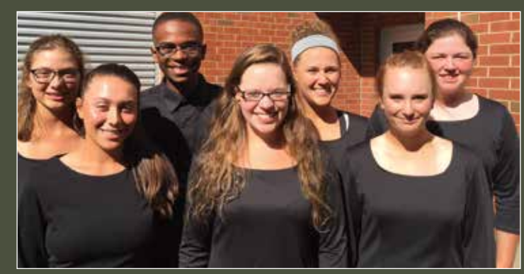
Nation Ford High School Clarinet Choir (Fort Mill Schools) will perform during the Saturday second general session.

Various student performance groups will showcase their talents throughout the convention. Those scheduled to perform include: River Bluff High School Gator Band, Lexington School District One; Nation Ford High School Clarinet Choir, Fort Mill Schools; Eighth Grade Star Singers, Dorchester School District Two; and Kennedy On Stage, Aiken County Public School District.