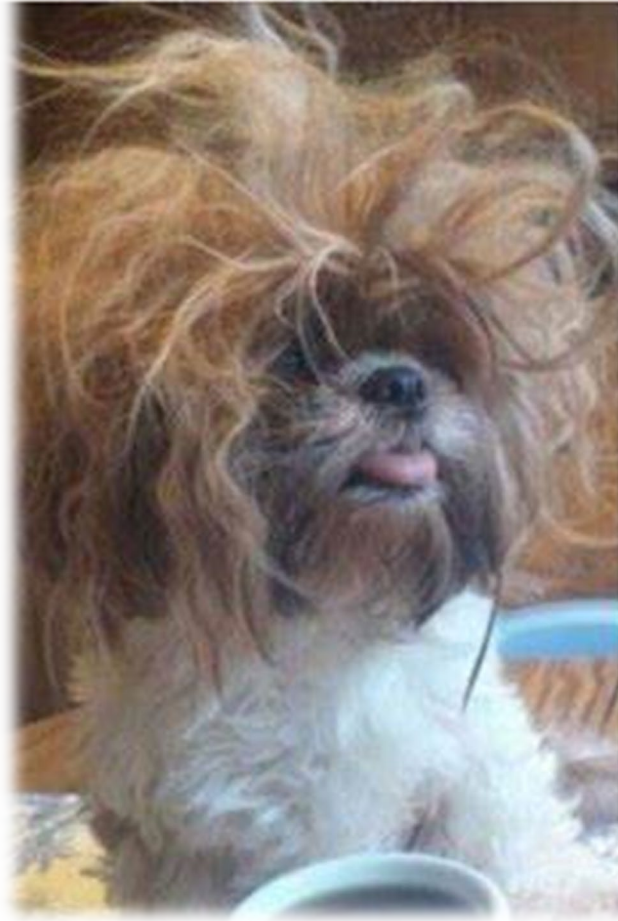
Zoom meeting, audio only